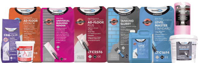
Part of the Bond It LevelMaster Range

The data presented in this leaflet are in accordance with the present state of our knowledge, but do not absolve the user from carefully checking all supplies immediately on receipt. We reserve the right to alter product constants within the scope of technical progress or new developments. The recommendations made in this leaflet should be checked by preliminary trials because of conditions during processing over which we have no control, especially where other companies raw materials are also being used. The recommendations do not absolve the user from the obligation of investigating the possibility of infringement of third parties rights and, if necessary clarifying the position. Recommendations for use do not constitute a warranty, either expressed or implied, of the fitness or suitability of the products for a particular purpose.